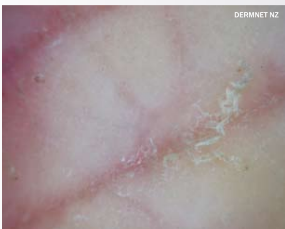
Fig 3: Dermoscopy reveals tiny grey triangles (the head of the female mite) at distal ends of burrows on fingers

may also affect the face and scalp. 2 Vesicles and pustules on the palms and soles are characteristic of scabies in infants, and may persist for several weeks after the mites have been successfully destroyed. 5