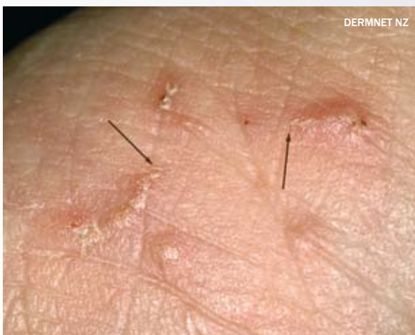
Fig 2: Scabies burrows with arrows to show where the mite can be seen on magnification