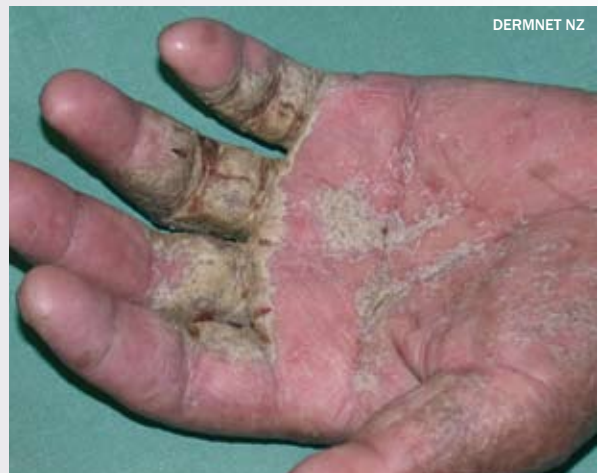
Fig 4: Typical crusted scabies in elderly hospitalised patient

Scabicides should be applied to the entire body from the chin and ears downwards. The face and scalp should also be included for infants under two years, people who are immunocompromised and elderly people (but avoiding contact with eyes). Particular attention should be paid to the area between toes and fingers, genitals and under nails (a soft nail brush may be necessary). 8 This rarely causes stinging or irritation. Treatment needs to be reapplied to areas that are washed within the necessary application time (such as after hand washing). It can be helpful for a second person to assist with the application to areas that are not easily accessible.