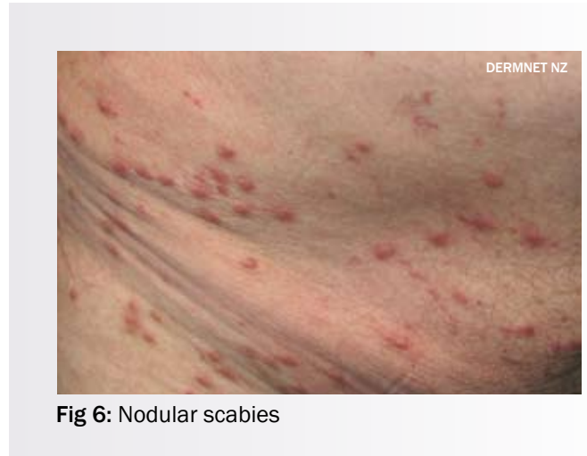
Fig 6: Nodular scabies

Itch beyond six weeks after initial treatment may indicate treatment failure (particularly if itch persists at the same level or is increasing in intensity). This could be due to re-infestation, inadequate treatment of contacts, resistance to therapy, or an incorrect initial diagnosis. Consider an alternative diagnosis and re-examine the person. If the diagnosis of scabies is established, a different scabicide should be tried if all contacts were originally treated simultaneously, and the treatment was correctly applied. 2