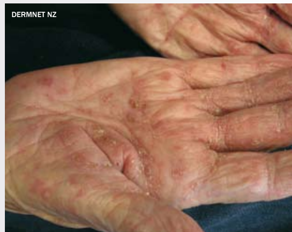
Fig 5: Crusted scabies in rest home resident: numerous burrows on palms

Note: The BNF recommends application of scabicides to the entire body, including the head and neck for all people. 8