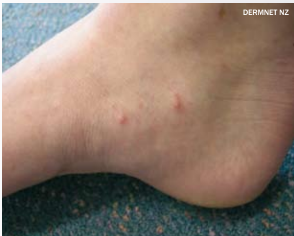
Fig 1: Burrows on foot of young adult patient