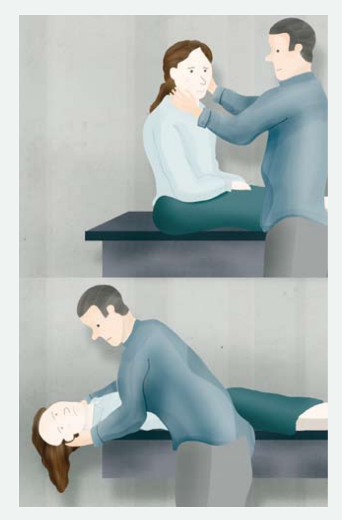
Adapted from BMJ Best Practice<sup>4</sup>

Repeat the test on the opposite side. Ideally, test the suspected normal ear first and the suspected symptomatic ear second. If there is no nystagmus it is not BPPV.